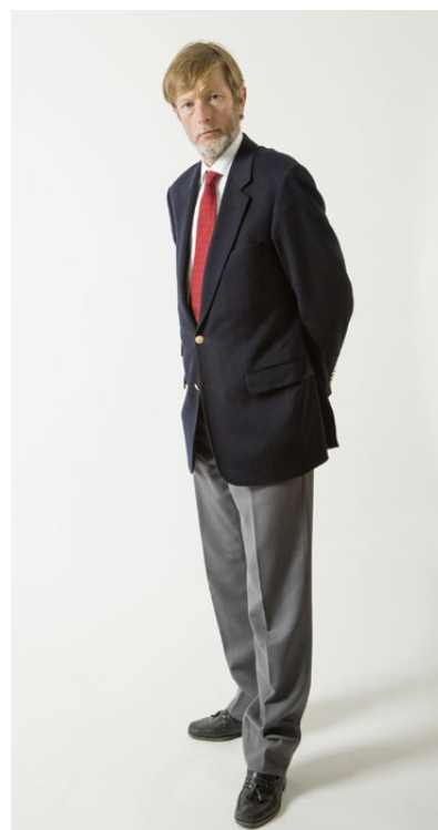
Stockholm in August 2016

So stay with us, time is on our side and we intend to continue to share our strong balance sheet with our investors as we let our other strengths play out within our chosen industry!