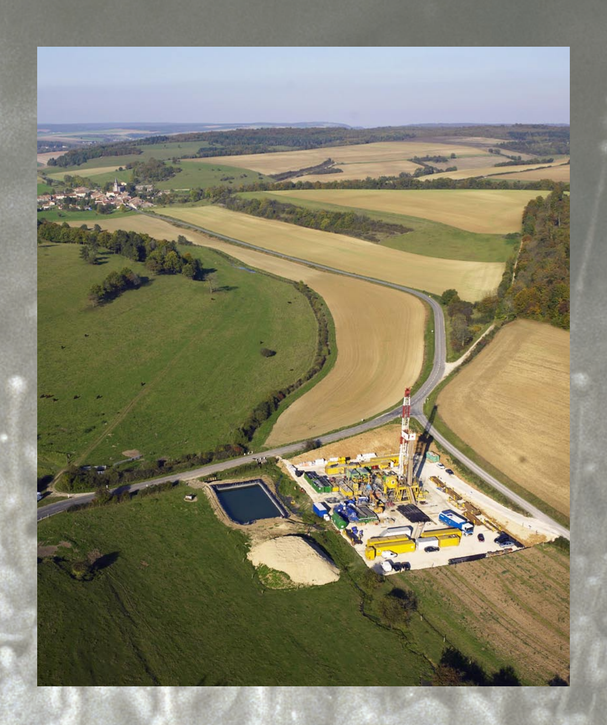
Tethys Oil AB (publ)

Report for the period 1 January 2007 – 30 September 2007